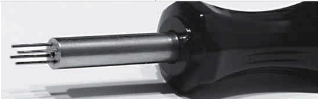
1,5 mm 4-lock tang-tool, MKR/MKS LKW: Mack, MAN, Renault, Volvo MIBOTOOL part-no.: 99032