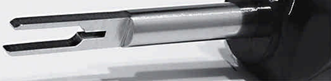
2,8 mm flat-type extraction tool, junior power timer-contact MIBOTOOL part-no.: 88040