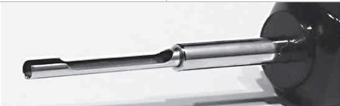
1,0 mm Ø Terminal tag contact DEUTSCH-contact MIBOTOOL part-no.: 90014