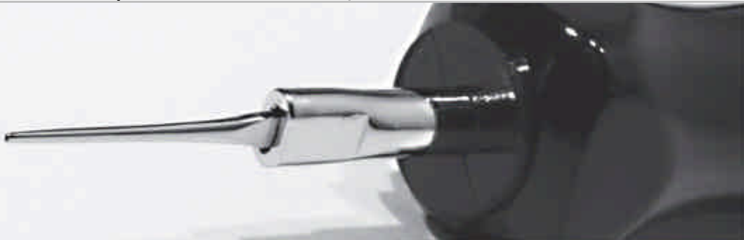
0,8 mm flat-type extraction tool, Ducon-contact, ABS-housing MIBOTOOL part-no.: 88069