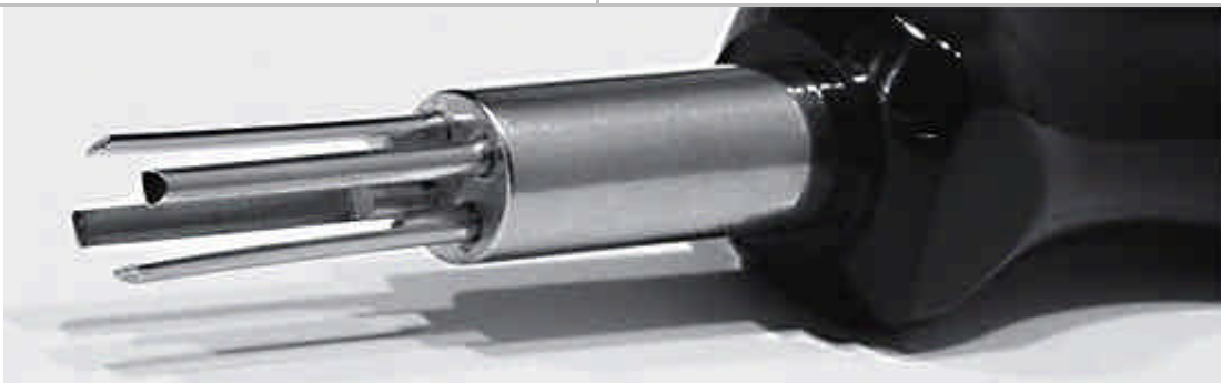
4-lock tang-tool, „Deutsch“-housing MIBOTOOL part-no.: 24090