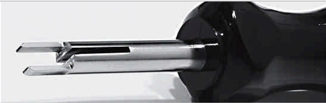
2,8/5,8 mm flat-type extraction tool (with 2 lock tangs), SLK 2,8: MIBOTOOL part-no.: 90002