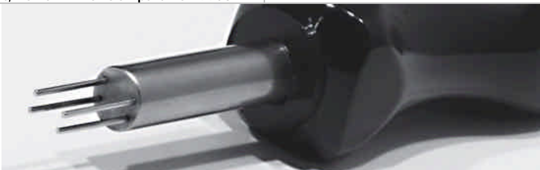
2,8 mm 4-lock tang-tool, BOSCH BDK/BSK 2,8 TYCO MCP 2,8 LKW: Mack, MAN, Renault, Volvo MIBOTOOL part-no.: 99032