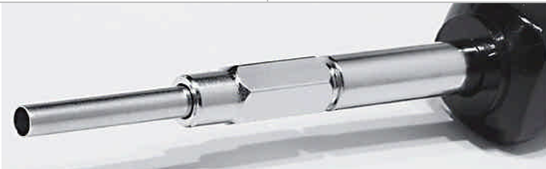
2,3 mm Ø round-deblocking tool