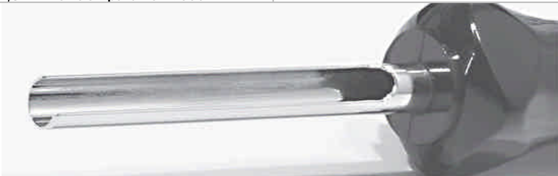
Terminal tag contact MIBOTOOL part-no.: 90013