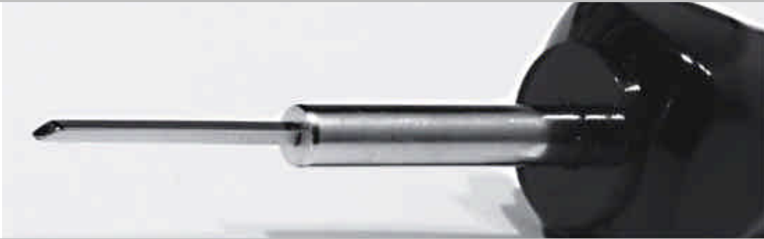
1,6 mm flat-type extraction tool, Micro-Timer I-contact JT, Ducon, GAE MIBOTOOL part-no.: 99032