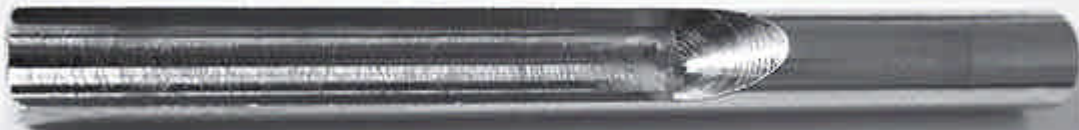
Insertion help tool MIBOTOOL part-no.: 87067