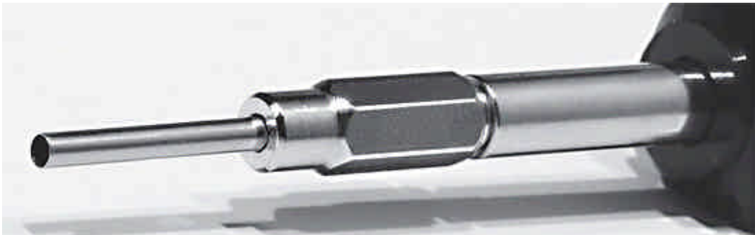
1,2 mm Ø round-deblocking tool MIBOTOOL part-no.: 87025