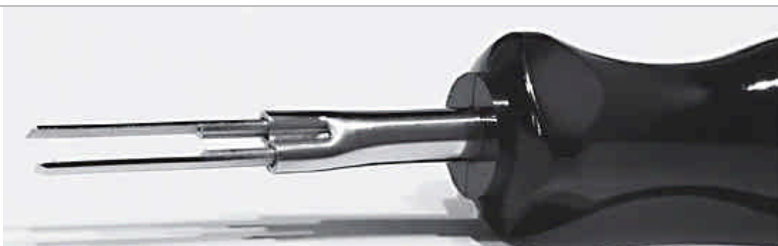
1,5 / 2,8 mm for flat pin connector DELPHI * Ducon-contacts

Comparable with MAN part number: 80.99606-0600