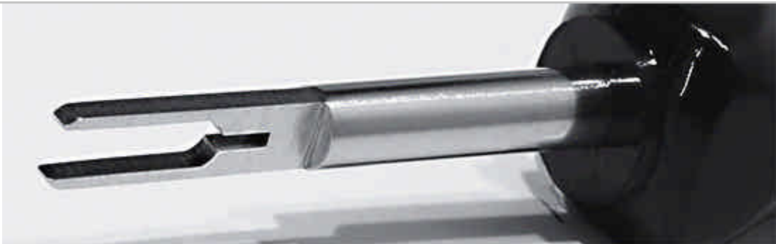
2,8 mm Fork Extraction tool Junior Power Timer-contact

Comparable with MAN part number: 80.99606-0596