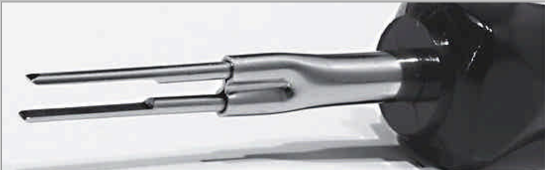
Fork connector remover / fork extraction tool for Micro Timer connector

Comparable with MAN part number: 80.99606-0599