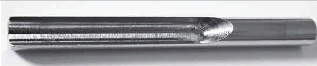
Connection aid to re-lock extracted ABS contacts

Terminal and extraction tool for ABS connectors and contacts