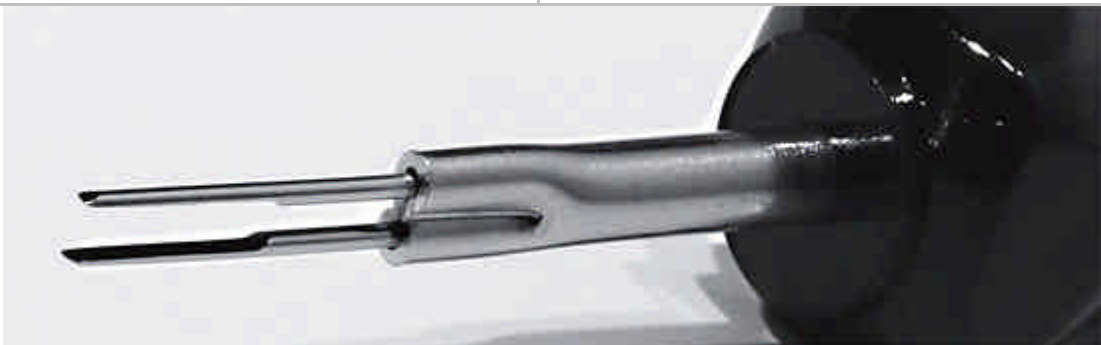
1,5 mm Fork terminal extraction tool for Micro Timer II and III Contacts

Comparable with MAN part number: 80.99606-0591