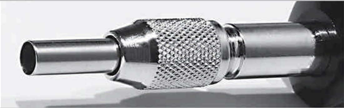
5,3 mm Ø Contact remover extraction

Comparable with MAN part number: 80.99606-6121