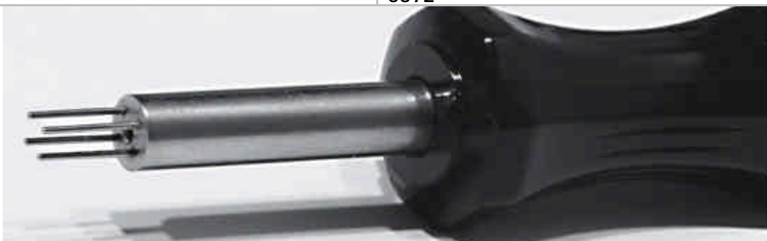
1,5 mm 4-pin connectors 4-pin lock MKR/MKS Extraction and removal tool for MKR / MKS contacs

Comparable with MAN part number: 80.99606-0572