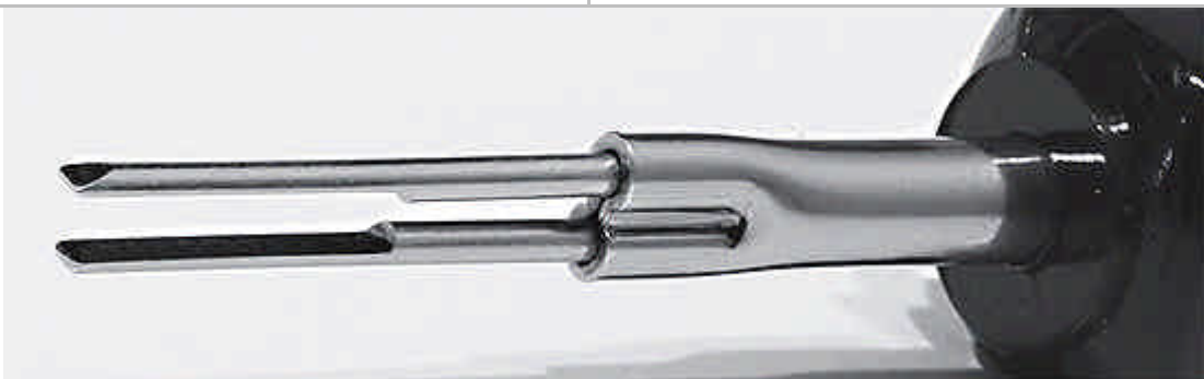
2,8 mm Fork Extraction tool for flat contacts with asymmetric locking mechanism

Comparable with MAN part number: 80.99606-0592