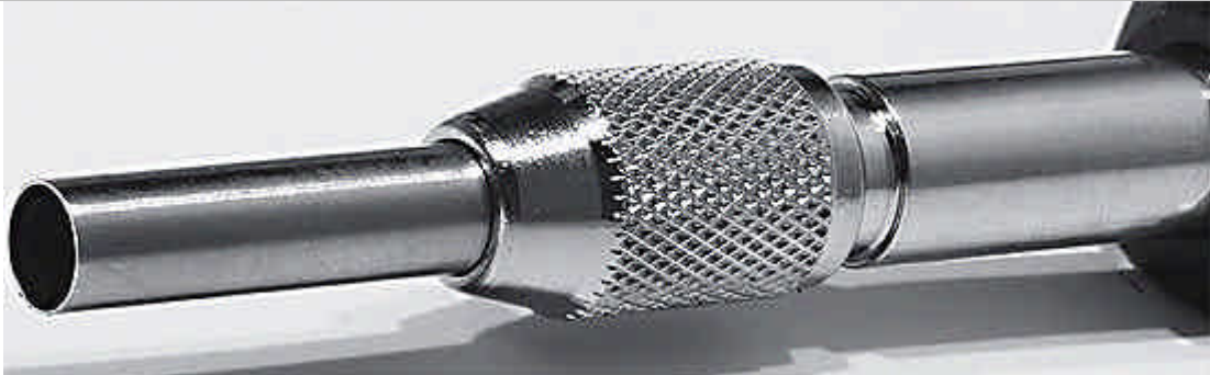
4,0 mm Ø ABS-contact remover, ABS connector extraction

Comparable with MAN part number: 80.99606-6121